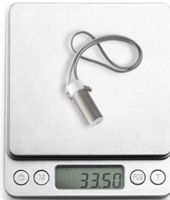
A purifier: \approx 33.5g